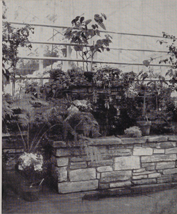
Cozy Nook in Our Hall of Flowers

DURING THE FLOWERING SEASON , our nursery is visited by a large number of people who are delighted by the beautiful picture our outdoor beds present. Each variety in turn is distinctly different and is a study in beauty in its own right. Our Tuberous Begonias are grown from carefully selected seeds, and with proper care will develop into larger and more sturdy plants. Advice on the care of Begonias cheerfully given.